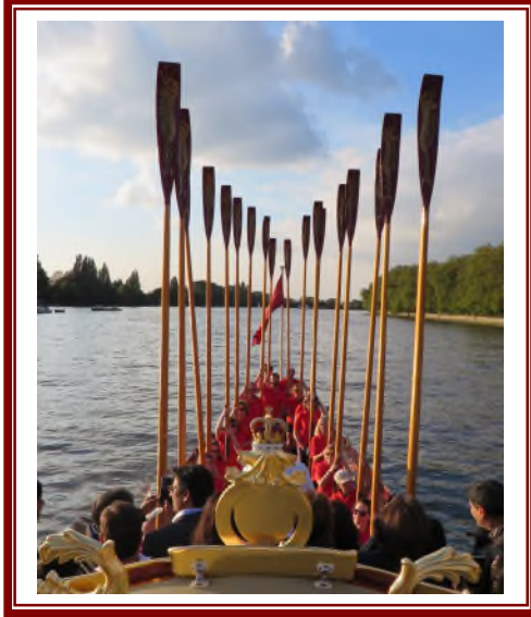
The London RC crew salute theirs and other boathouses of Putney during the early evening row

An auction cruise on behalf of the Save Children Fund, postponed from 2013 for various reasons, finally took place from Chelsea Harbour Pier on 19 th September with, once again, a crew from London RC providing the manpower.