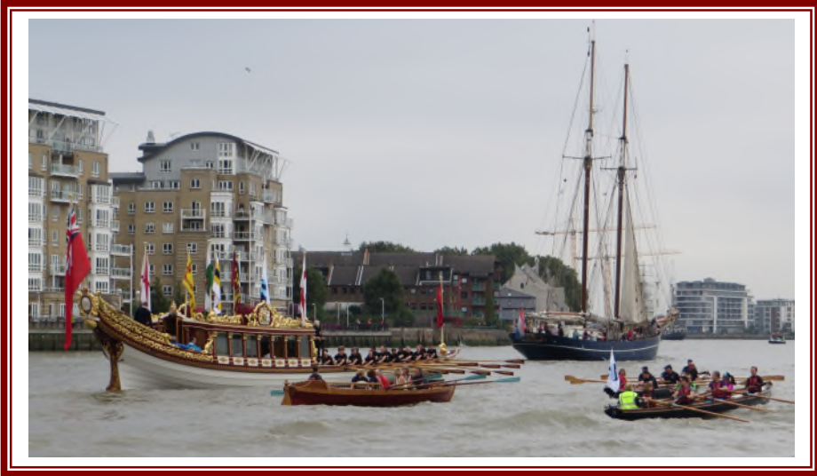
'Gloriana' astern of the Dutch tall ship 'Oostershelde' with a few of the row past flotilla