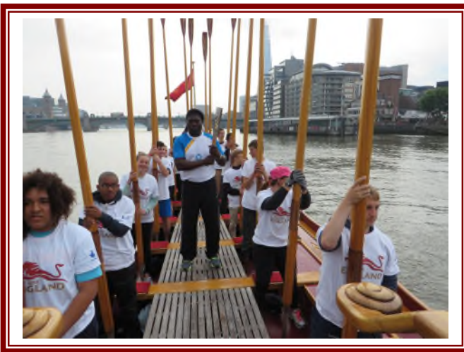
The Queen's Commonwealth Games Baton on board

A crew from The Ahoy Centre in Deptford ( www.ahoy.org.uk ) was invited to row the leg from the London Fire Brigade pier in Lambeth to Bankside Pier, Southwark beside The Globe theatre.