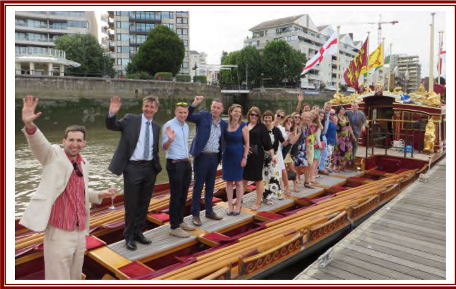
The guests showing their appreciation to the rowing and Ops crew of 'Gloriana'.

In early July, another auction cruise supporting the work by the British Asian Trust saw 'Gloriana' being rowed by a crew from London RC. The winner had generously donated the opportunity to come on board to the staff of his son's school in East London.