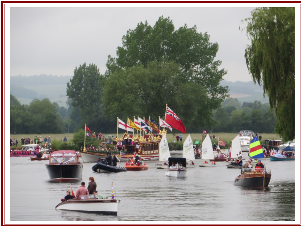
The Queen's Row Barge 'Gloriana' with her escort of forty boats of all shapes sizes plus the sailing dinghies of Cookham Sailing Club arriving at the first stop in Cookham watched by 100's on the bank

With VIP guest on board 'Gloriana' set off downriver through Marlow Town Regatta, which suspended racing to permit her passage, the crew receiving assistance from Olympic and senior oarsmen and women from Marlow RC.