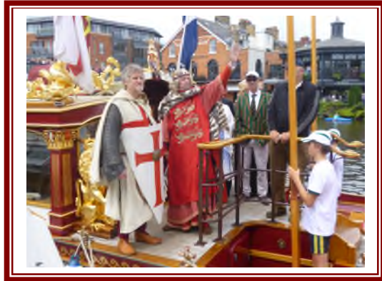
King John acknowledging his subjects before continuing his Royal Progress to Runnymede

After mooring overnight at The Oakley Court Hotel and in Datchet, the flotillas continued downstream on a dank, grey morning to stop for the last time in Eton and Windsor where King John joined his Royal barge 'Gloriana', now being rowed by crews from Windsor Boys School.