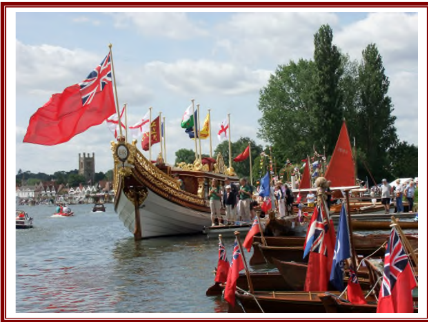
'Gloriana' was centre stage with boats moored above and below her along the bank – on display for all to see her.

The Festival is a rally of boats built of wood and riveted steel only, no fibre glass and no welded steel boats are permitted to attend. Those participating included the Dunkirk Little Ships, numerous traditional launches and rowing boats, and many other splendid craft from up and down the Thames, whilst ashore traditional boat building skills and recent historical events are celebrated with great enthusiasm, with many of those attending dressing in period costume.