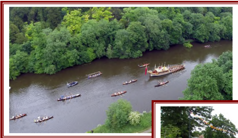
The Herald flotilla making passage down the Cliveden reach

'Gloriana' and her escort of skiffs and cutters in Boulter's lock watched by the crowds.