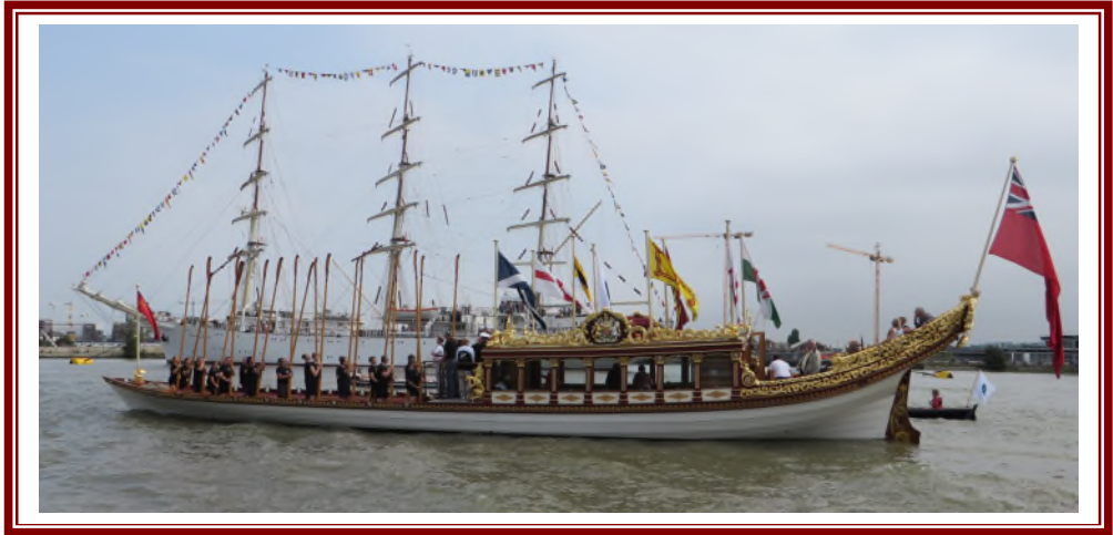
The 'Gloriana' crew from Poplar RC saluting the Polish Frigate 'Dar Mlodziezy'

The Thames Festival Classic Boat Regatta in St. Katherine Docks once again had 'Gloriana' in the centre basin on view to the thousands of visitors over the two day event on 13 th /14 th September.