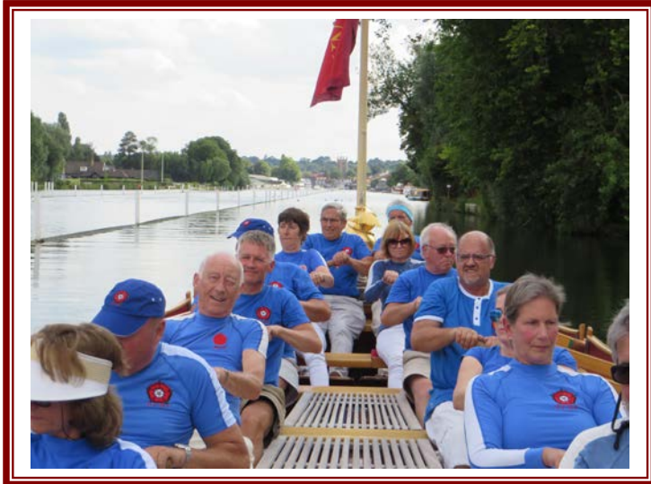
The Phyllis Court RC crew enjoying the row on the Henley reach to the Traditional Boat Festival site.

The Rug Company, who generously donated the Royal rug on the commissioning of 'Gloriana', were to be the main sponsors of this years Thames Traditional Boat Festival. An early evening reception was held on board the barge with a small group of invited guests being treated to an early evening row down the Henley mile.