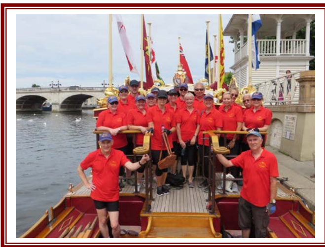
The judicial rowing group 'The Bench Blisters' crewed 'Gloriana' once again with great style.