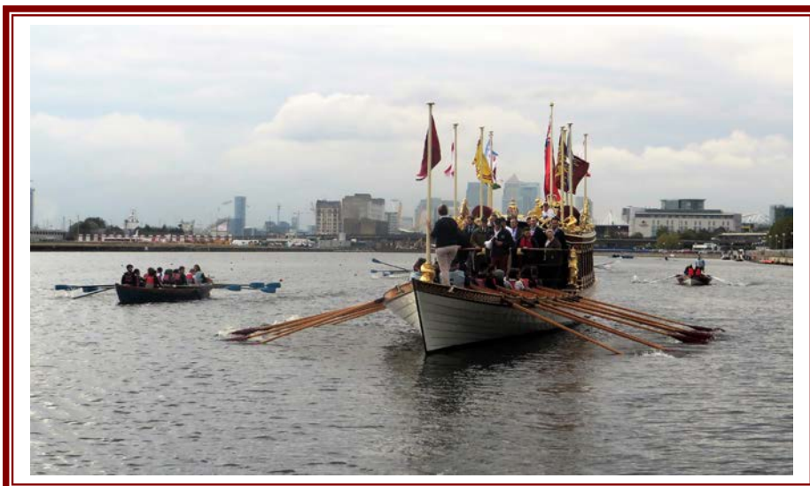
The two winning crews rowing 'Gloriana' in the celebration flotilla escorted by their fellow students

The day on the water was rounded off with the fastest crews from each academy rowing 'Gloriana' escorted by the other eight skerries