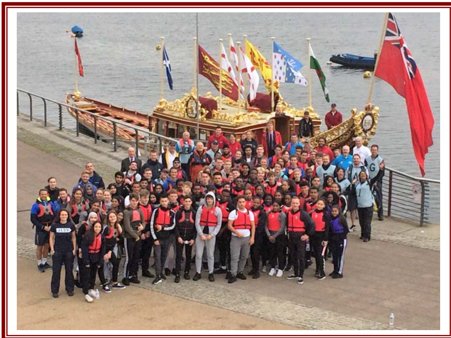
The eighty youngsters who had a great day 'messing about in boats!'

The post event feedback from the youngsters was extremely heart-warming with comments such as "Amazing!", "Life changing", "Awesome" and we understand at least five of the youngsters have found their way to a rowing club and are continuing their enjoyment of the sport.