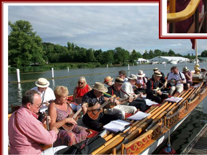
The local Ukulele band serenade the crowds from the rowing deck of 'Gloriana'.