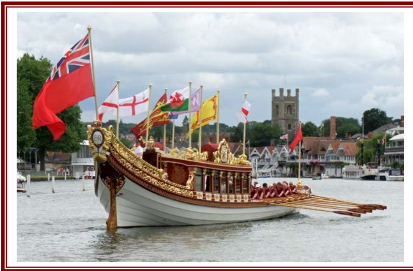
Prince Michael of Kent and the Wargrave Boating Club crew in salute

For the first row past the barge was crewed by boys and staff from Shiplake College who had great fun even though the weather was rather wet. Later we welcomed Prince Michael of Kent on board and a crew from Wargrave Boating Club rowed the course.