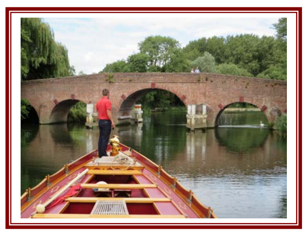
After a night at private moorings in Wargrave 'Gloriana' made a clear passage up through Sonning bridge before returning downstream.

This now opens the river up to us as far as the next low bridge at Culham lock cut ~ the river beckons!