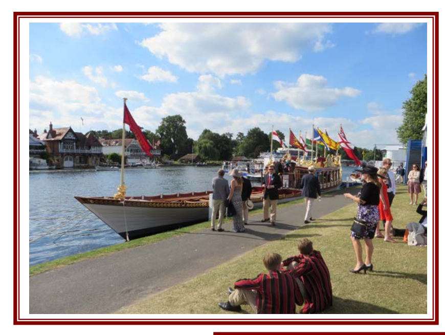
'Gloriana' fully dressed attracted the crowds throughout the five days becoming the meeting place of choice.

The crew from Pangbourne College rowing down past Phyllis Court Club before their row past up the HRR course ~ a memorable day for all those on board.