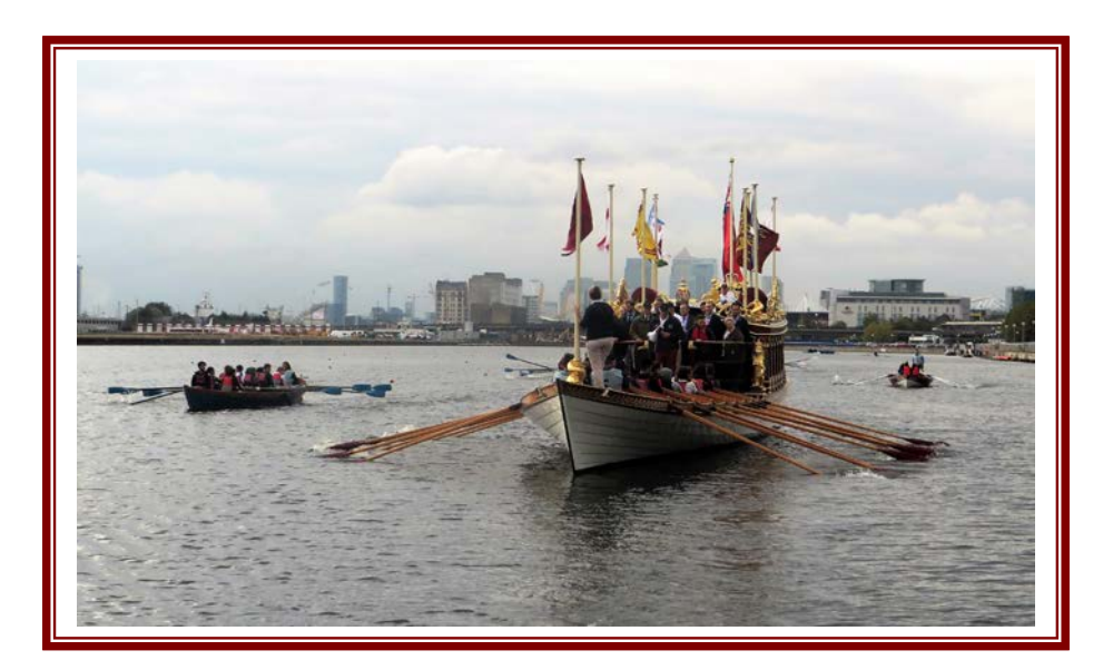
The two winning crews rowing 'Gloriana' in the celebration flotilla escorted by their fellow students

The day on the water was rounded off with the fastest crews from each academy rowing 'Gloriana' escorted by the other eight skerries