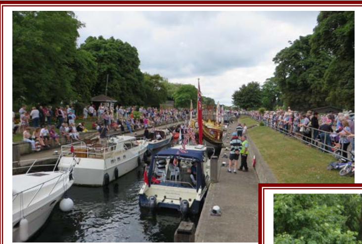
A second crew from Burway RC and Sir William Perkins School rowed 'Gloriana' from Chertsey to Staines

Boats from all the different clubs along the river were invited and came to join at various stages whilst at every lock hundreds of people came to see the Royal barge and her escorts.