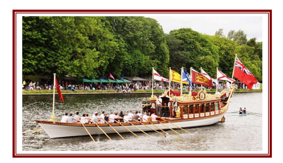
A volunteer scratch crew rowing up past the regatta enclosure

'Gloriana' now moved upstream to attend Kingston Town Regatta. This was with the support of the Royal Borough of Kingston upon Thames with whom the Trust are now in discussion about the building of a Royal boathouse.