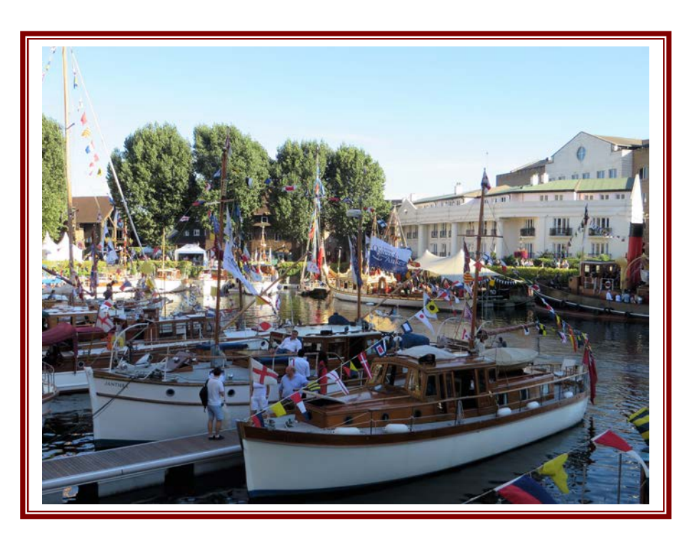
'Gloriana' was moored on the central pontoon and open to invited guests and close enough for all the visitors to enjoy the finery of her decorations.

After a short spell in Shepperton Marina 'Gloriana' returned downstream to St. Katherine Docks in preparation for the Classic Boat Festival where she was once again centre stage.