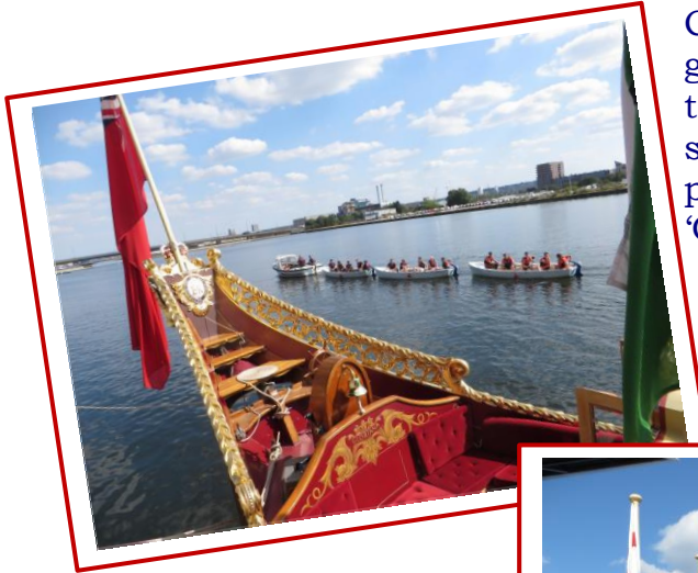
Crews going up to the start passing 'Gloriana'

On the day of the regatta 'Gloriana' was moored beside the course allowing all the competitors a close-up view as they went up to the start of their races whilst invited guests from all the area sections of the Sea Cadets were welcomed on board for short visits.