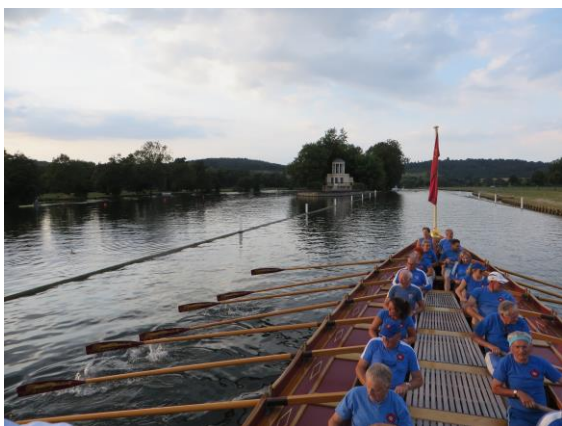
The guests and crew enjoyed a peaceful early evening row down the Henley reach turning below Temple Island.

The next three days saw 'Gloriana' making her way upstream to Henley arriving for an evening reception for The Rug Company at the site of the 2018 Thames Traditional Boat Festival on Fawley Meadow.