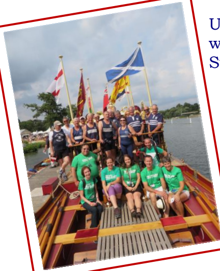
Upper Thames RC with Macmillan Support volunteers

Over the next three days five crews took 'Gloriana' with guests of the Festival for a row down the reach as part of the celebrations and displays at this annual festival of traditionally built boats ~ no fibreglass allowed!