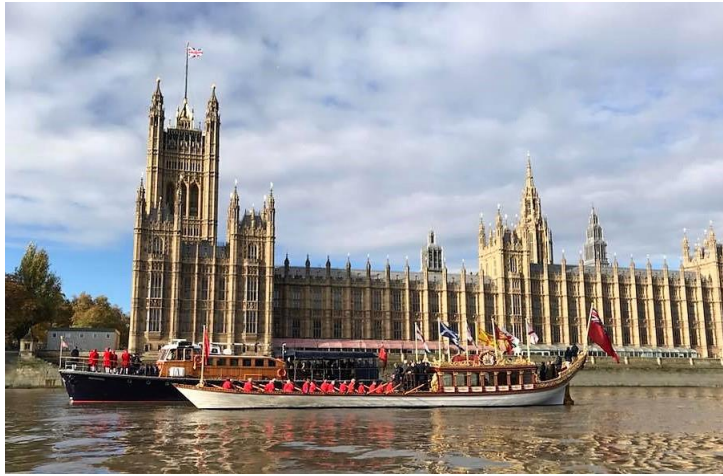
The crew of 'Gloriana' waiting for the order to spread their poppies on the River Thames