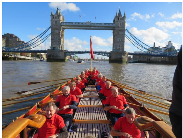
The invitation crew of friends and supporters of the Royal barge, a very eclectic group ~ Olympians, Paralympians, Atlantic rowers, World Record holders, HRR winners and some who just enjoy messing about in boats ~ wonderful fellowship through rowing.