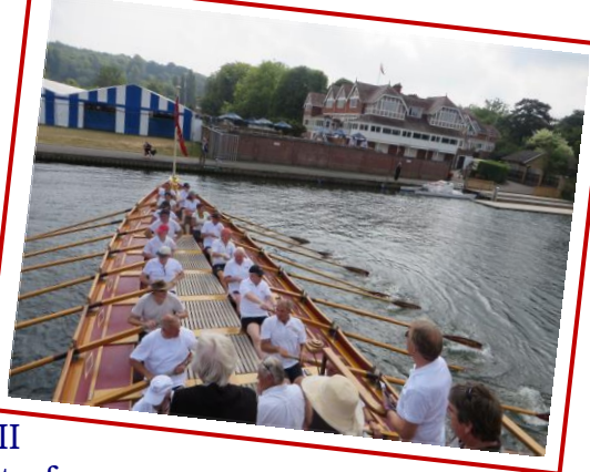
Leander Club Presidents XVIII turning in front of their clubhouse