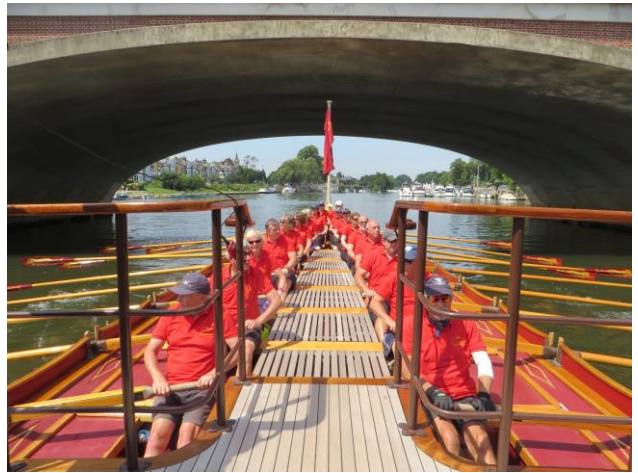
Rowing under Hampton Court Bridge

The following day 'Gloriana' made her way upstream a couple of miles to Walton RC where she was to take part in the celebrations by Cranmore School for the 50 th anniversary of their rowing club.