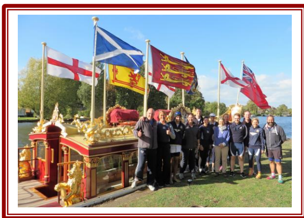
Commissioner Cressida Dick CBE QPM joins the Met. rowers beside 'Gloriana'

The UK National Police Rowing Championships back upstream at Walton RC was the next outing for 'Gloriana'. Crews from four forces around the UK came together for an enthusiastic days rowing which culminated in an invitation crew from all the forces coming together to row 'Gloriana'.