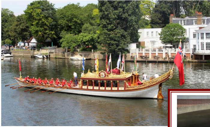
'Gloriana' arriving at Molesey lock to collect the guests