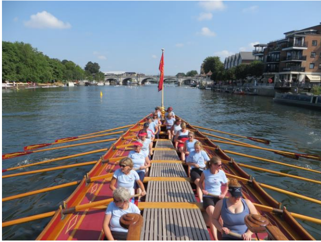
Arriving in Kingston in style with ladies from Weybridge Ladies Amateur Rowing Club at the oars

'Gloriana' now spent three weeks in Shepperton Marina under-going minor repairs to some woodwork before once again making her way downstream to Kingston upon Thames for the annual regatta.